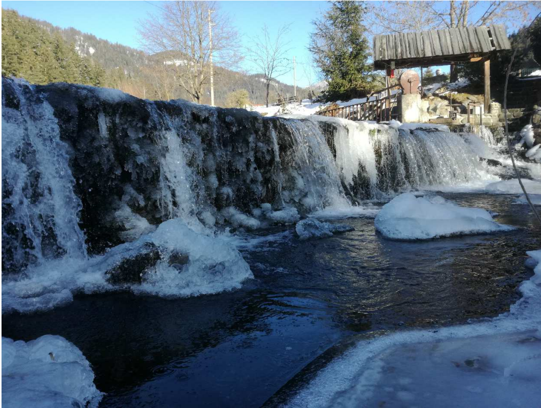
Photo 7 – artificial dam – lower barrier of the proposed compartment